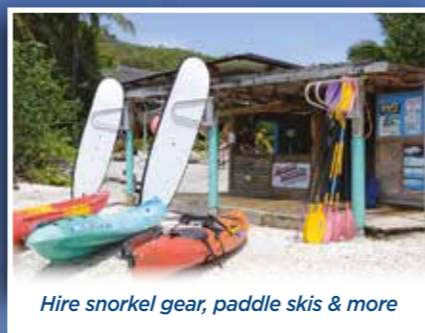
Hire snorkel gear, paddle skis & more