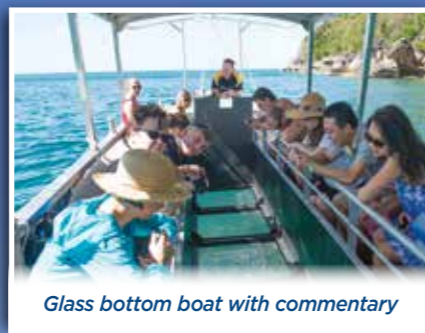
Glass bottom boat with commentary