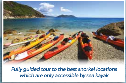
Fully guided tour to the best snorkel locations which are only accessible by sea kayak