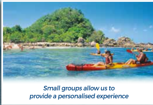
Small groups allow us to provide a personalised experience