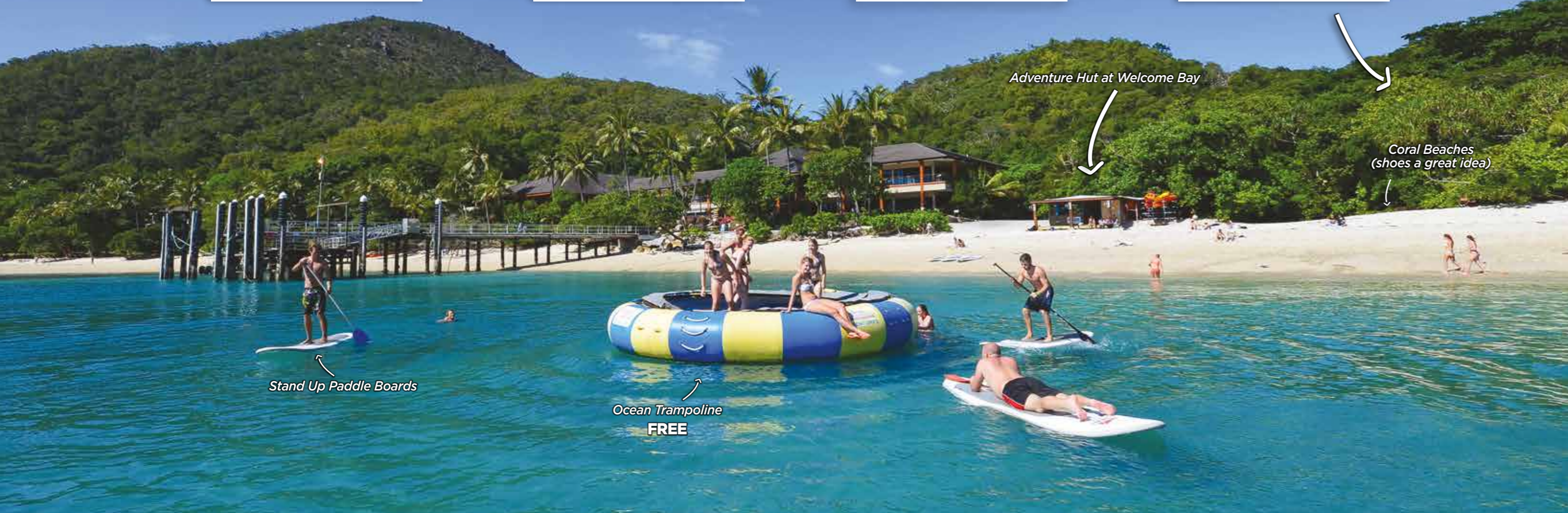
Adventure Hut at Welcome Bay